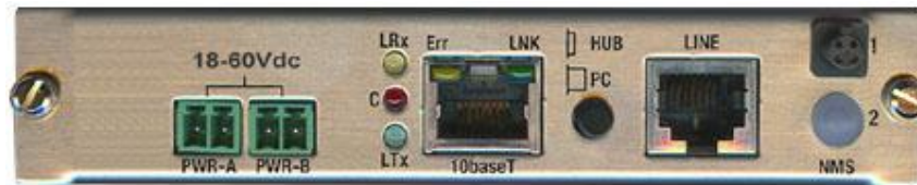
DSL-4608.Eth rear panel